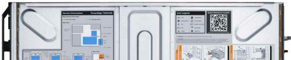
Figure 3. QRL location

Dell PowerEdge 12 th generation servers feature a Quick Resource Locator (QRL) – a model-specific Quick Response (QR) code that is located inside the T20 chassis cover (see Figure 3). Use your smartphone to access the Dell QRL app to learn more about the server.